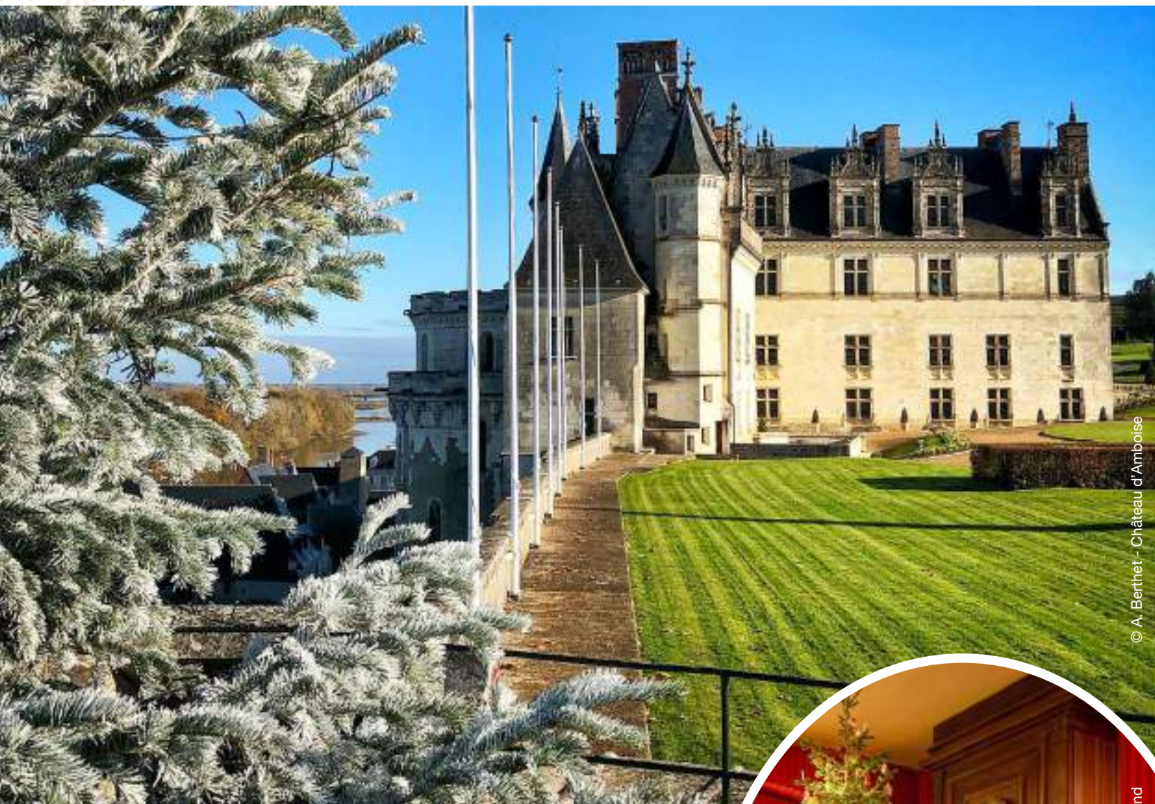
© A. Bertinet - Château d'Amboise

The little Renaissance princes celebrated the nativity festivities at the royal chateau of Amboise. Now, 500 years later, this joyous tradition lives on. Magical decors for "Christmas, childhood dreams" enrich the permanent collections and enable different generations to unite around memories and the