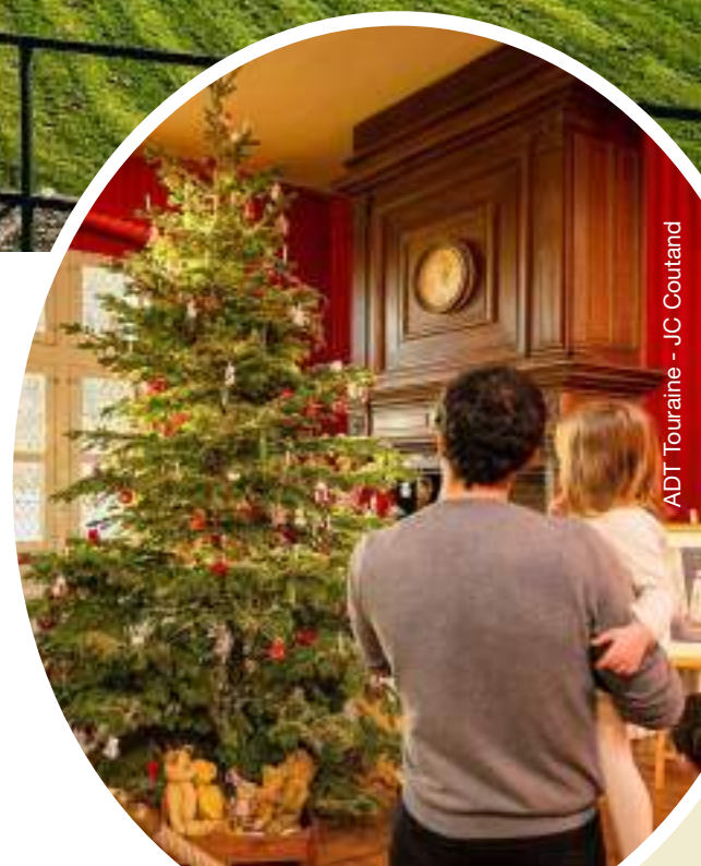
ADT Touraine - JC Coutand

imagination of Christmas from our younger years. Staged on a grand scale, and renewed every year, this display is installed throughout the visitor route from the beginning of December to the beginning of January . No supplement payable for access.