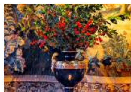
The Guards Walkway