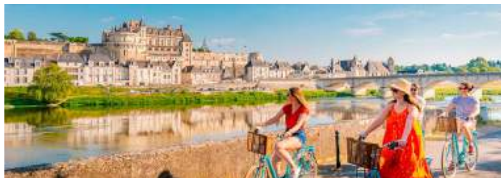
Photo credits: © FSL (p. 2, 3, 4, 6, 7, 8, 9, 10), © ADT Touraine - JC Coutand (p. 5, 6, 7, 8, 9, 10), © L. De Serres (p. 2, 3, 6, 10), © Lucas Pavy (p. 4), © L. Scour (p. 6), © B. Moriceau (p. 7), © blérotphoto_CGR_006 (p.7), © Histoverly (p.8), © Sarah Veyseyre (p. 10). - Map: © 100 millions de pixel, © FSL