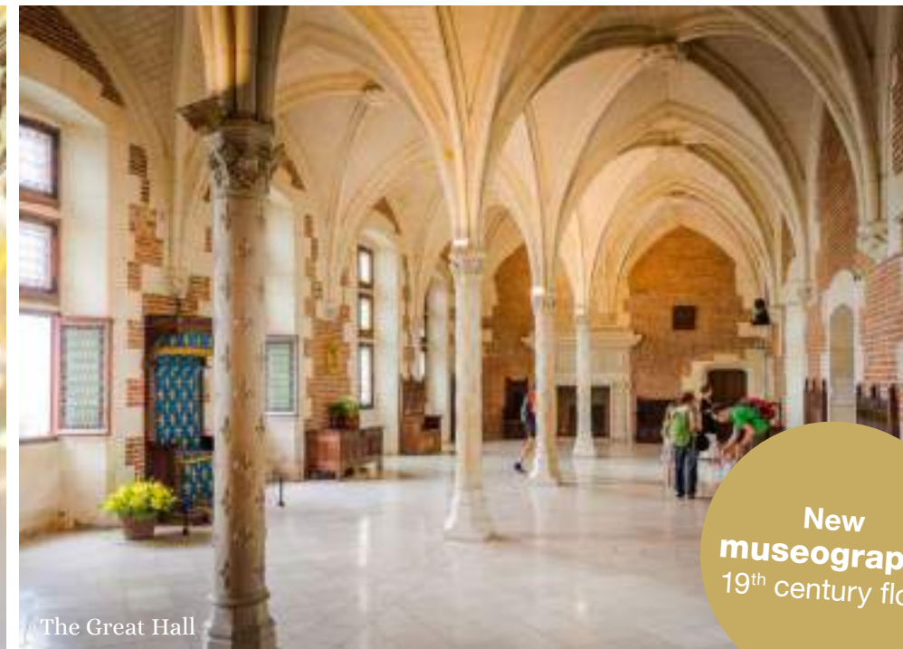
The Great Hall