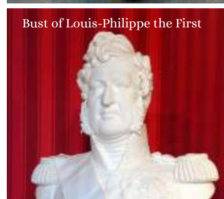
Bust of Louis-Philippe the First