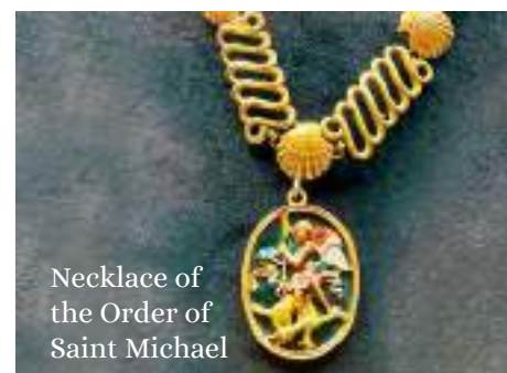
Necklace of the Order of Saint Michael

During the visit, discover an exceptional collection of Gothic and Renaissance furniture. Linger in the Great Hall where royal audiences and banquets were held, before taking the prestigious cavalier towers and admiring their architectural singularity, unique in the Loire Valley.