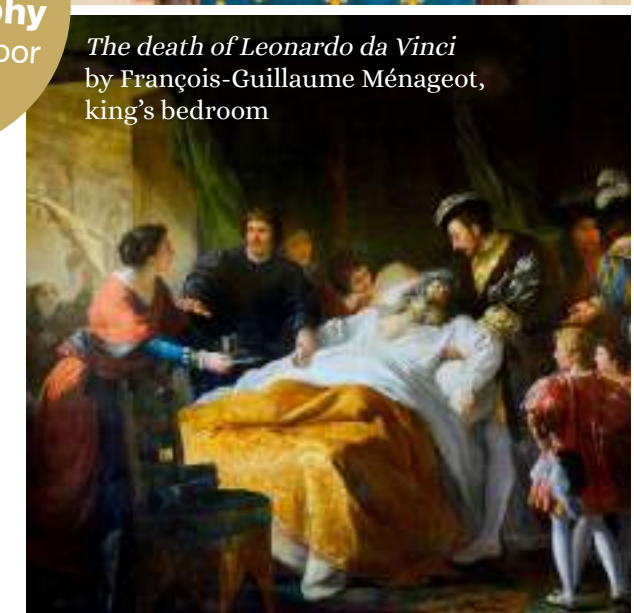
The death of Leonardo da Vinci by François-Guillaume Ménageot, king's bedroom

During the visit, discover an exceptional collection of Gothic and Renaissance furniture. Linger in the Great Hall where royal audiences and banquets were held, before taking the prestigious cavalier towers and admiring their architectural singularity, unique in the Loire Valley.