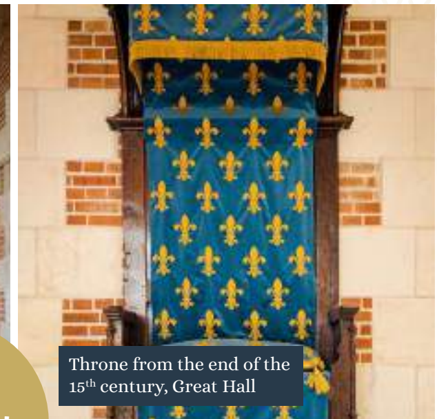
Throne from the end of the 15 th century, Great Hall